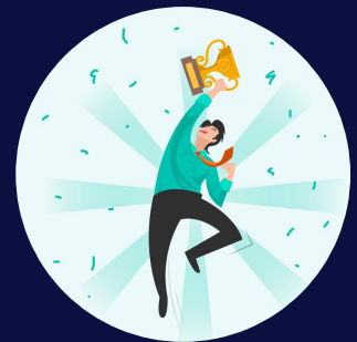
Rewards & Recognition